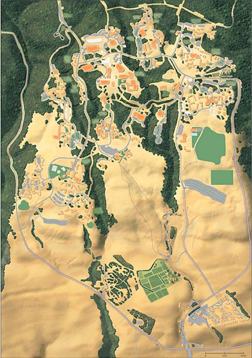
ILLUSTRATIVE PLAN: EXISTING CENTRAL AND SOUTH CAMPUS